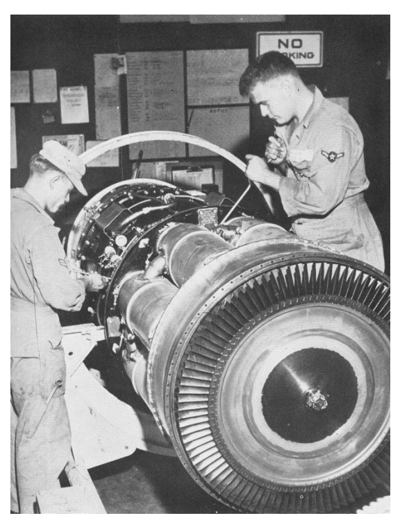
6 FMS, Jet minor overhaul.

DEPARTMENT OF THE AIR FORCE UNIT HISTORIES