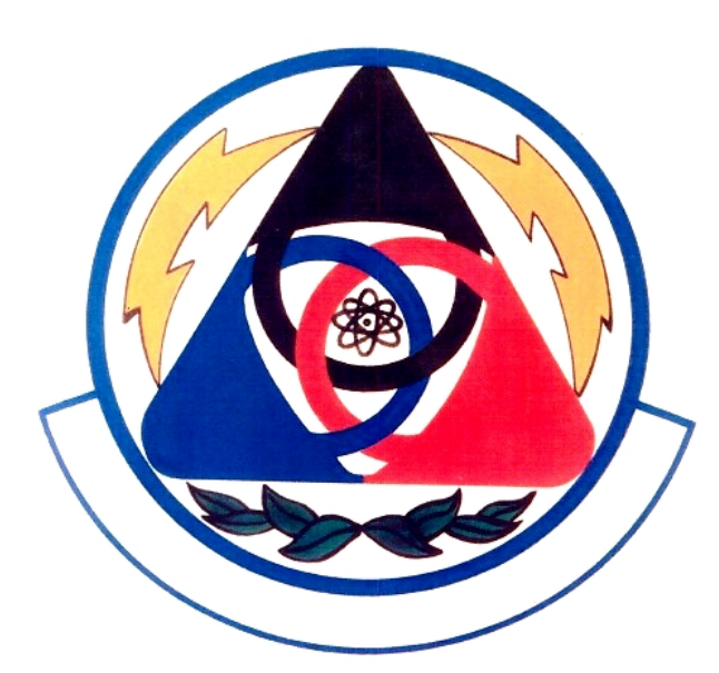
6 Consolidated Aircraft Maintenance Squadron emblem approved, 20 Feb 1968

6 Maintenance Squadron emblem: On a blue disc, a black raven's head with red eye, behind a stylized white refueling boom with a red contrail fimbriated yellow charged with a yellow star, issuing from upper right to lower left; overall a white disc bearing a stylized triangle, one point up, black on top blue on the left and red on the right, voided by a white triangle one point down, emitting a green and yellow king cobra with red eye and tongue and white fangs, all within a narrow yellow border. Attached above the disc a blue scroll bordered yellow inscribed "PRIDE,"