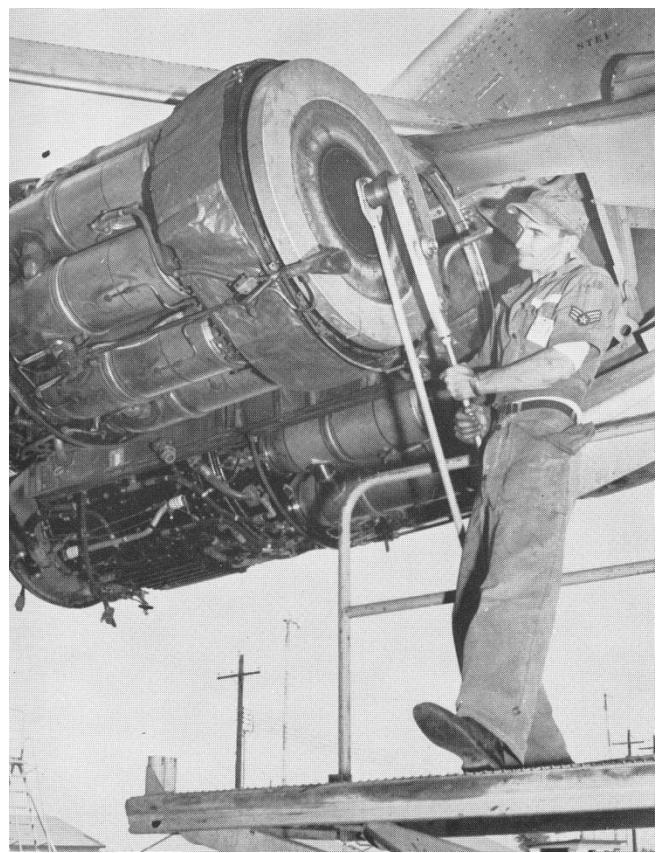
6 FMS, Jet inspection—developing muscles.