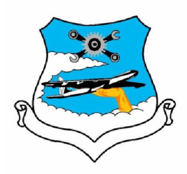
6 Field Maintenance Squadron emblem approved, 9 Aug 1958