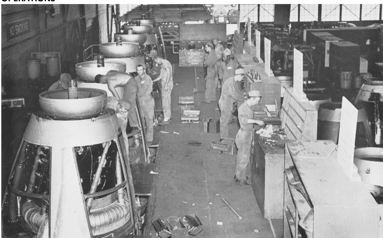
6 FMS Finale assembly.